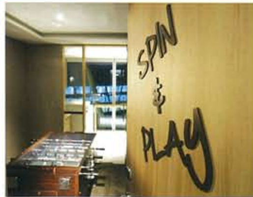
Above: Cool off in the superb swimming pool. Right: Enjoy fun and games in the Spin & Play launderette. Far right: A large gym for working out any stresses from your day in the office

Whether or not you consider yourself a part of the digital generation, a stay at Capri by Fraser, Changi City / Singapore will certainly add another dimension to your stay in this vibrant nation.