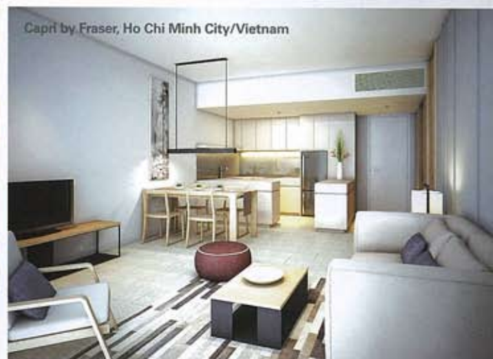
Capri by Fraser, Ho Chi Minh City/Vietnam