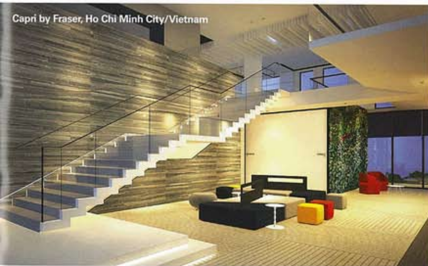
Capri by Fraser, Ho Chi Minh City/Vietnam

Fully redesigned and refurbished, Fraser Residence Shanghai features 324 Gold-Standard, contemporary serviced residences and excellent facilities. Located in the heart of the Luwan district, it is a relaxing, tranquil sanctuary set in a vibrant downtown location. Just a block away from Fraser Residence Shanghai lies Huaihai Road and the bustling shopping and entertainment hub of Xintiandi. The property's chic address is complemented by equally stylish interiors. Guests will appreciate the greatly enhanced meeting facilities, high speed WiFi throughout, tempting new dining options, wellness spa, gym and indoor heated pool. Offering a home customisation option, this gives residents the added flexibility of putting their personal imprint on their serviced residence, secure in the knowledge that the more 'practical' side of things is being well taken care of. For more information, refer to shanghai.frasershospitality.com