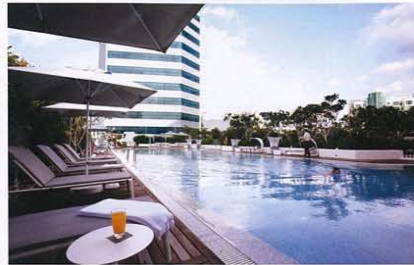
Left: A gorgeous executive floor serviced residence brings new levels of luxury and comfort – note the Eames lounge chair and ottoman. Opposite, below: Families enjoy the property's thoughtful facilities. Above: The swimming pool. Right: This beautiful bedside lamp is one of many stylish designer touches found in the bedrooms