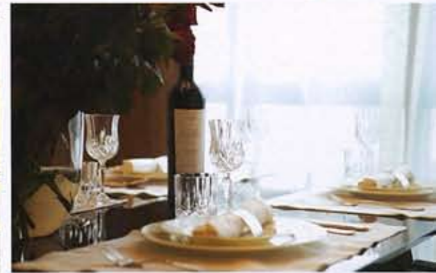
Above: Entertain guests in style in the executive floor serviced residence's spacious dining area. Left: The kitchen is extensively equipped with the latest appliances including a dishwasher. Below: A convenient study area in a two-bedroom serviced residence. Below left: Enjoying the outdoor kids' playground