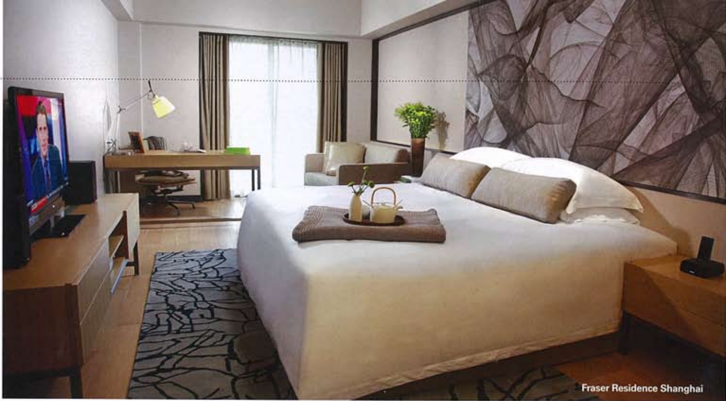
Fraser Residence Shanghai